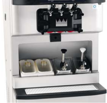
Integrated Syrup Rail Option - 2 room temperature with lids & ladles, 2 heated with syrup pumps

During long no-use periods, the standby feature maintains safe product temperatures in the mix hopper and freezing cylinder.